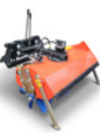
With snow brush roller