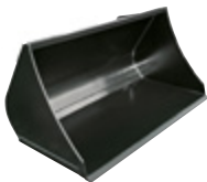
Soil bucket round for compact loaders

Strong soil bucket for heavy loads and earthworks, optionally available with ripper prongs, overflow protection and reversible knife.