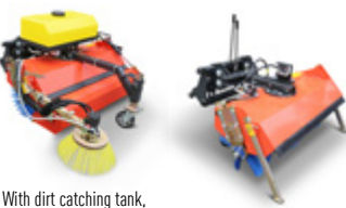
With dirt catching tank, water tank, spray nozzles and side-mounted brushes