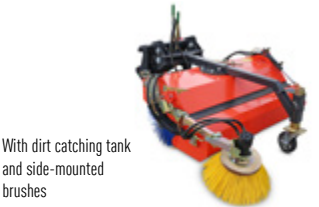
With dirt catching tank and side-mounted brushes

Sweeping machine with dirt catching tank and hydraulic drainage or without tank. On demand also available with snow brush roller (suitable for greenery), water tank with spray nozzles and side-mounted brushes, hydraulic side adjustment (incl. selection valve). Different brush diameters possible: 520 mm / 600 mm / 700 mm