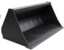
Soil bucket round for wheel- and telescopic loaders